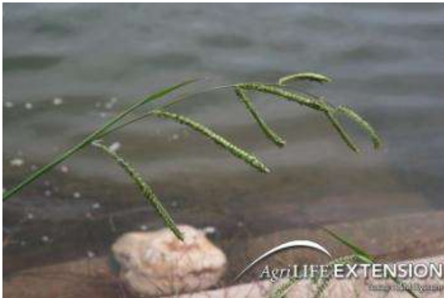
Control with Sulfonylurea - Revolver